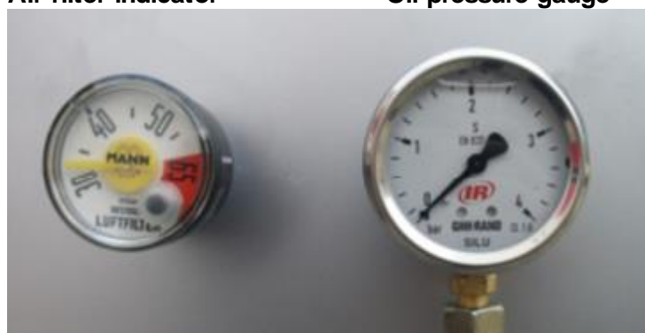
Oil pressure gauge