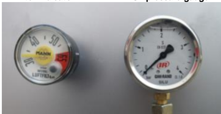
Oil pressure gauge